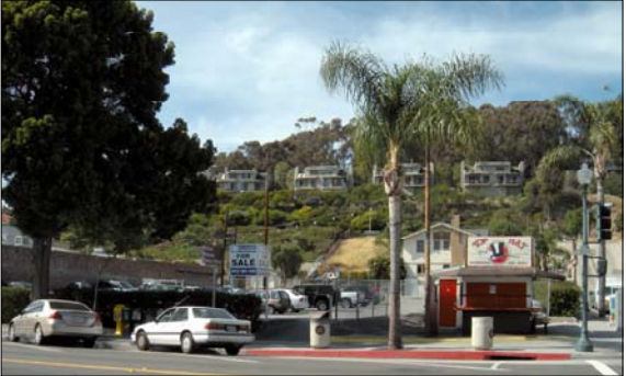
LOOKING AT FRONT OF PROPERTY FROM MAIN ST.