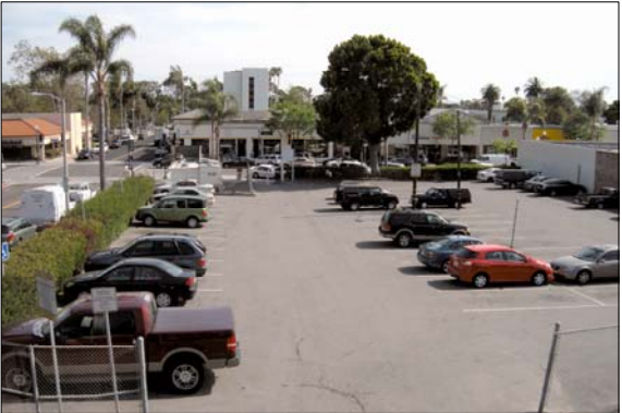
LOOKING FROM BACK OF PROPERTY TOWARD MAIN ST.