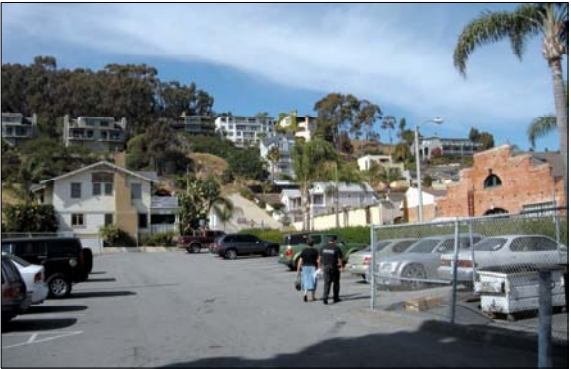
LOOKING FROM MAIN ST. ENTRANCE TOWARD BACK OF PROPERTY